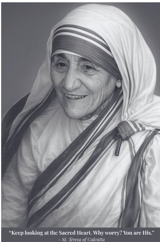
"Keep looking at the Sacred Heart. Why worry? You are His." - St. Teresa of Calcutta

For Mother Teresa, the Sacred Heart of Jesus represented God's infinite, "thirsting" love for humanity and the ultimate remedy for the suffering of the poor.