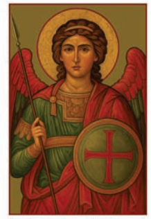
ST. MICHAEL THE ARCHANGEL